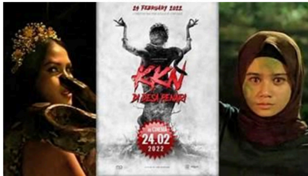
Figure 2. Scene film KKN di Desa Penari (2022)

Offerings are traditionally dedicated to ancestral spirits, deities, or supernatural forces believed to influence human life (Gazali et al., 2023). Through these representations, the film portrays Sesajen as an important cultural practice rooted in respect, balance, and spiritual obedience.