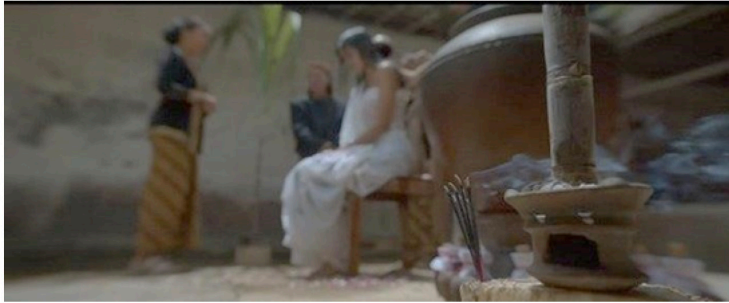
Figure 1. Ritual cleansing ( Ruwatan ) scene in the film Primbon

In Javanese society, Ruwatan ceremonies are often accompanied by traditional Wayang Kulit (shadow puppet) performances. The play most frequently performed in these contexts is Murwakala , which tells the story of Batara Kala , a mythical giant associated with misfortune. Wayang performances have long been an integral part of Javanese cultural life, serving not only as artistic entertainment but also as a spiritual medium in ritual practices. Susanti & Lestari (2020) note, Wayang holds historical and symbolic significance as a means of seeking protection from life's uncertainties and maintaining social balance during Ruwatan ceremonies.