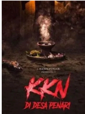
Figure 3. Sesajen in the film KKN di Desa Penari (2022)

From Barthes' perspective, myth operates not only as a cultural narrative but also as a system of signs that produces ideological meaning. In KKN di Desa Penari , Sesajen is represented as a mystical object closely associated with supernatural terror and spiritual punishment. The film therefore positions Javanese spiritual practices within a horror framework that naturalizes the association between local culture and mysticism. Although the film contributes to preserving cultural narratives, it simultaneously commodifies sacred rituals by transforming them into entertainment-oriented horror aesthetics for mass audiences.