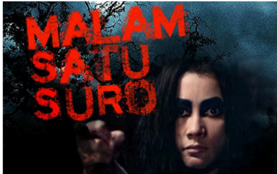
Figure 6. Poster for the 1988 film Malam Satu Suro

The central myth represented in the film is the belief surrounding Malam Satu Suro, a sacred night in the Javanese calendar associated with spiritual power, ritual practices, and supernatural activities. In Javanese tradition, Satu Suro is considered a spiritually significant period during which prayers, wishes, and rituals are believed to possess stronger metaphysical influence (Nur, 2016). The film represents Malam Satu Suro as a moment when the boundary between the physical and spiritual worlds becomes increasingly fragile, enabling communication with supernatural beings and the performance of mystical rituals.