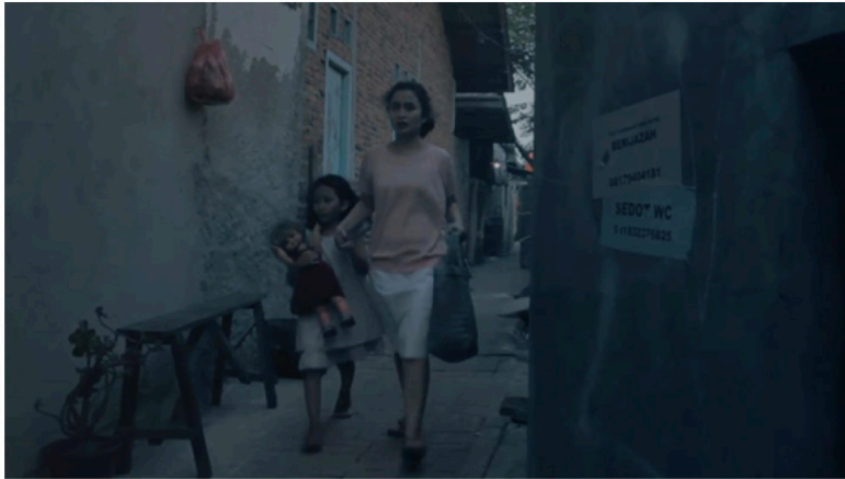
Figure 5. Scene from the short film Sandekala (2015)

The meaning of the Sandekala myth remains a mystery because it cannot be empirically proven and is primarily passed down through folklore. This myth serves as a cultural warning a moral prohibition aimed at protecting individuals from potential danger (Hidayatulloh, 2020) the film Sandekala conveys a moral message about following traditional advice: avoiding activities outside the home during Maghrib, as this time should be used for prayer and family togetherness.