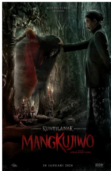
Figure 4. Poster of the horror film Mangkujiwo (2020)

Mythological motifs are also prominently represented in the Indonesian horror film Mangkujiwo , as discussed by Kurniawan & Santabudi (2023)). The film incorporates several Javanese myths, including Celeng Ludro, Pengilon Kembar (twin mirrors), and Tembang Lingsir, which function as central symbols of fear, curse, and supernatural power throughout the narrative. The story revolves around a young pregnant woman who is believed by village elders to be cursed and mentally unstable. Influenced by local superstition and mystical beliefs, the woman becomes marginalized, imprisoned, and subjected to ritual practices associated with supernatural forces. Through this narrative, the film portrays how mythological beliefs continue to influence social behavior, collective fear, and systems of authority within Javanese society.