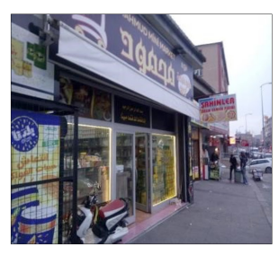
FIGURE 3. Multilingual signs in Sultanbeyli